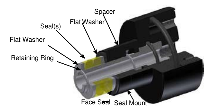
Diagram 2: FI7 with extended shaft and 2" NPT seal set